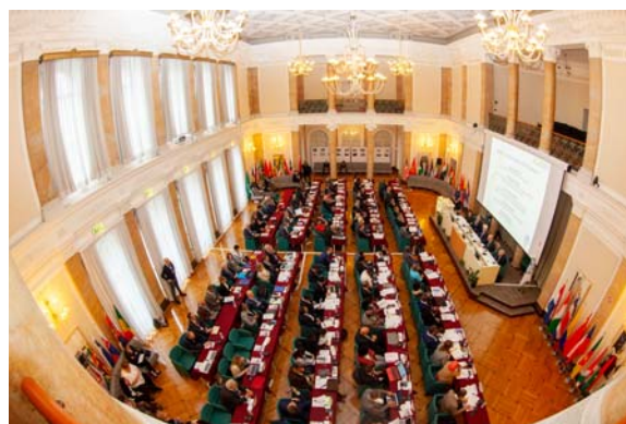
25th Session of the Board of Governors, Trieste, Italy

The rate of the annual assessment of membership is directly linked to the UN rate, corrected by a multiplier of 0.75; the minimum level of contribution is US$5000 and the maximum level of contribution is US$150,000.