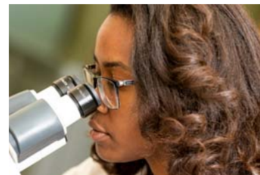
ICGEB laboratories in Trieste, New Delhi and Cape Town

In addition, the ICGEB offers the opportunity to establish Regional Research Centres (RRCs) to contribute to strengthen research skills, knowledge and capacities of the local scientific community while pursuing specific objectives for research, training and technology transfer to industry to benefit both the hosting country and the region where the RRC is located.