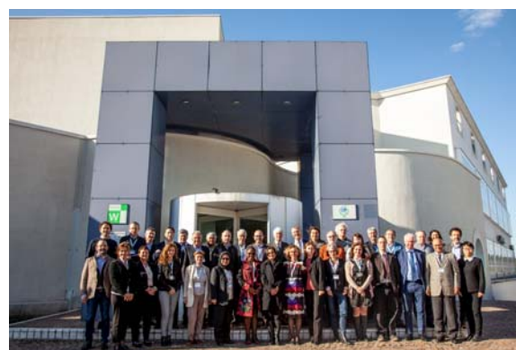
25th Session of the CSA, Trieste, Italy